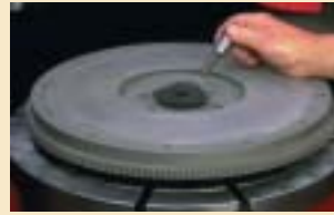
3. Install the centering cone, hold down the bolt, and tighten