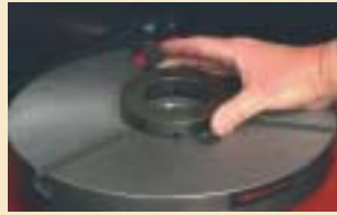
1. Select the flange adapter and place it on the rotary table