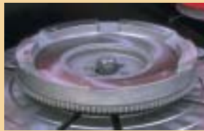
Import Stepped Flywheel