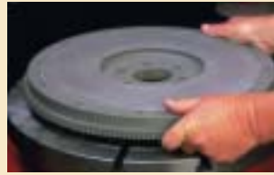
2. Lay the flywheel on the adapter