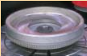
Automotive Stepped Flywheel