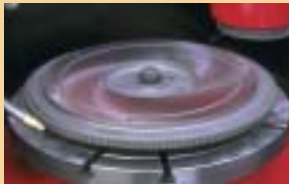
Truck Flat Flywheel