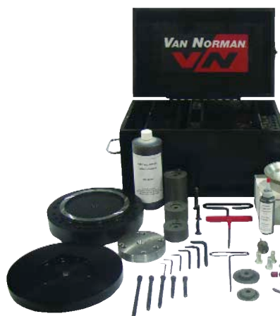
All the tooling necessary to grind clutch discs, pressure plates and racing-style flywheels.